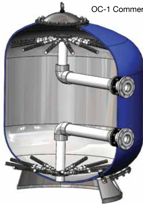
OC-1 Commercial Filter