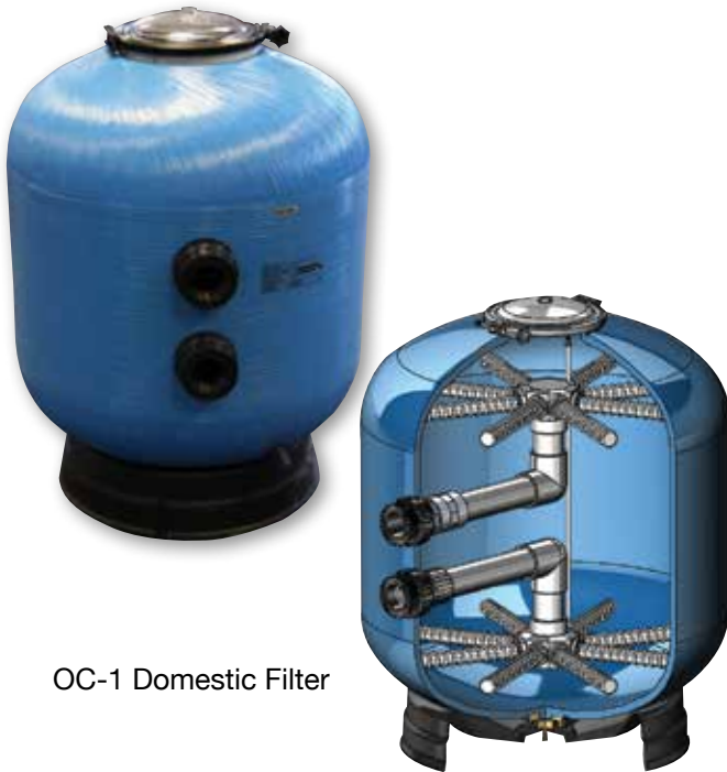
OC-1 Domestic Filter

OC-1 can reduce energy usage and water consumption. Its open cell formation makes it possible to achieve a greater flow of water through the filter. In many cases this means that pump speeds can be reduced by around 20%, without compromising the original flow, producing impressive energy savings. Alternatively, on new installations a smaller pump can be specified to produce the same flow – saving running costs and initial outlay. Due to its constant flow rate and huge debris capacity, OC-1 can reduce backwashing frequency and water consumption.